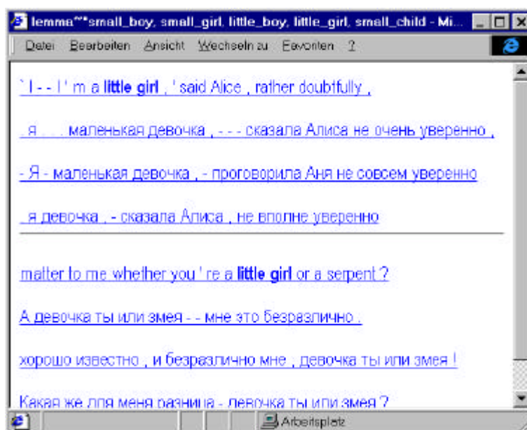
Figure 1 A concordance query result

The consultation function produces an HTML file with a KWIC (KeyWords In Context) list, which items are sentences that conform to the set of search criteria specified as a dedicated Perl function. The search criteria are applied to one sentence and may include all the information stored in the concordance about this sentence, e.g. co-occurrence of words within the sentence, specific morphological or lexical features of words, as well as their synonyms or translation equivalents. The search criteria can restrict the length of the context, which is extracted from found sentences and presented to the user. Also, the output can be sorted with respect to the left or right context of the found items or according to any other condition defined by a Perl function. As for translation equivalents, the respective parallel sentence or a hyperlink to it may be also included in the output. Each sentence in the output list can be explored with respect to its wider context, since it is hyperlinked to its position in the original text. The screen shot in Figure 1 shows the selection of English and Russian sentences, in which a size adjective (such as little or small ) is accompanied with a noun denoting a child ( girl , boy , child or children ).